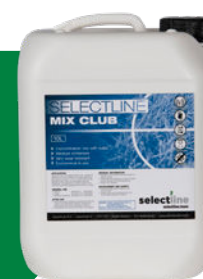
Selectline Mix Club (10L)

An excellent white line, favored by amateur sport clubs.