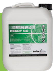
Selectline Ready Go (10L) Low consumption

Very economical and quick drying paint used by many top clubs.