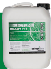
Selectline Ready Fit (10L) Low consumption

Our concentrated paints are characterized by their whiteness, stability in the can and are safe for the environment.