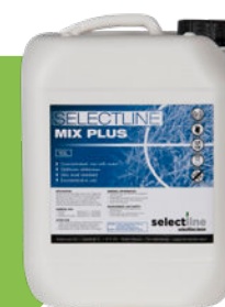
Selectline Mix Plus (10L)

A very high quality line with superb whiteness due to high volume of pigments.