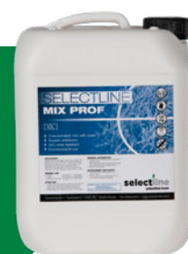
Selectline Mix Prof (10L)

Can be applied with all line marking machines.