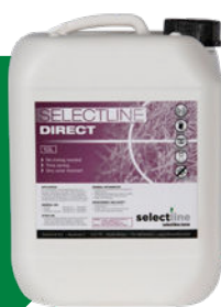
Selectline Direct (10L) High consumption

Highly durable and quick drying paint perfect for training fields.